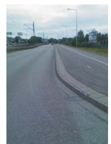
30 days after application