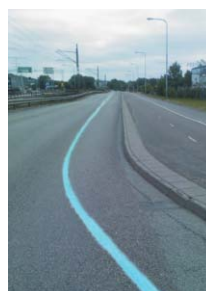
3 days after application