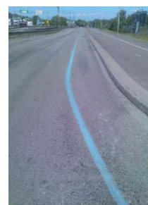
6 days after application (1 day after the marathon run)